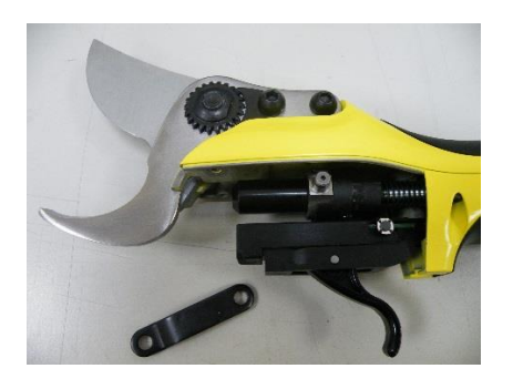
2-14 Remove the left side acting arm.