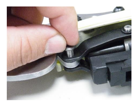
4-5 Insert the locking pin