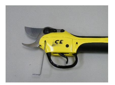
1-5 Disassemble the left side screw with the hex key provided