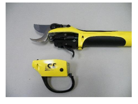
2-7 Take out the protection housing