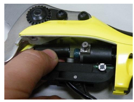
2-15 Remove the lead screw cover 12