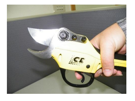
2-1 Position the blade opening to small opening

Before taking the steps, please follow the procedures 1-1~1-2(P.10) as mentioned above.