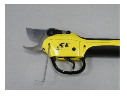
2-4 Disassemble the left side screw with the hex key provided