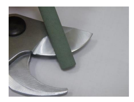
3-1 Polish the front side

Before taking the steps, please follow the procedures 1-1 ~ 1-3(P.10 &P.11) as mentioned above.