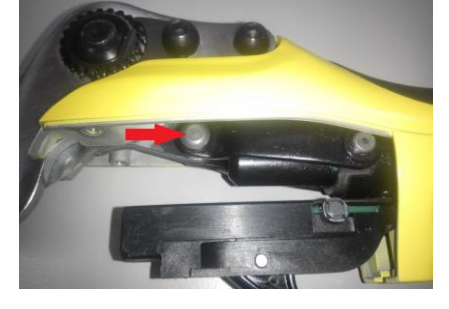
2-20 Insert the front locking pin to the acting arms