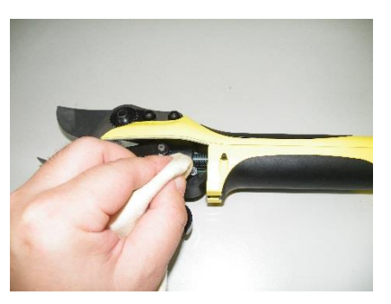
1-10 Wipe with dry towel

1-11 Following steps 6-1 \sim 6-6 (P.16) to put the Electric Trimmer together