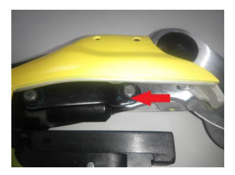
2-21 Insert the front c-clip to the acting arms

2-22 following steps 6-1 \sim 6-4(P.16) to put the Electric Trimmer together