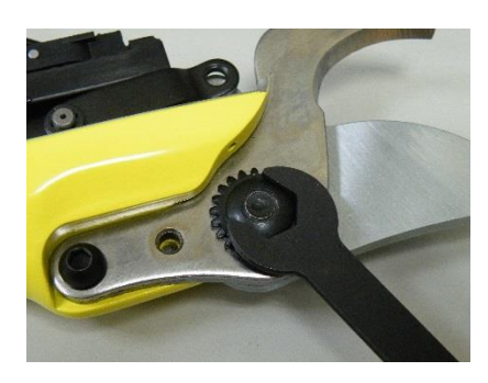
4-4 Adjust the tightness of the set screw with the wrench provided and check the gap of blade