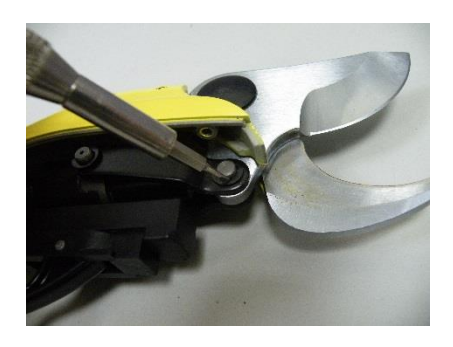
4-2 Flat screw drive to remove the c-clip