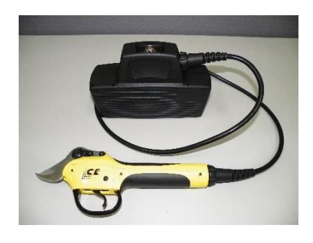
1-1 Connect to the power cable