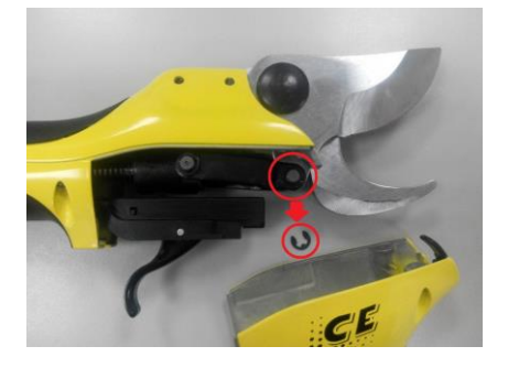
2-8 Take off the front c-clip from the acting arm.