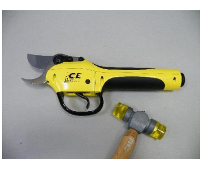
2-5 Knock on the trigger guard slightly, gently