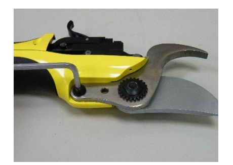
5-1 Disassemble the fixed screw with the hex key provided

Before taking the steps, please follow the procedures 1-1 \sim 1-8 (P.10 &P.11), followed by procedure 4-1 \sim 4-3 (P.14) as mentioned above.