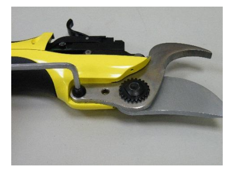
5-8 Tighten the blade assembly to housing with set screw. Using hex key provided