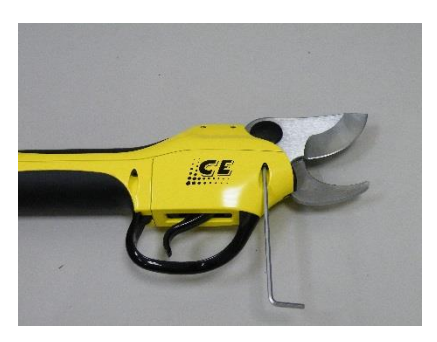
1-4 Disassemble the right side screw with the hex key provided