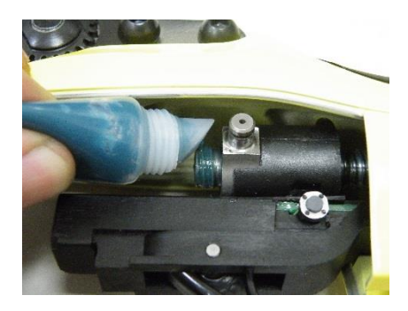
2-16 Properly grease the lead screw