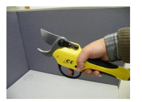
6-4 Turn the power on to test that it is operating normally