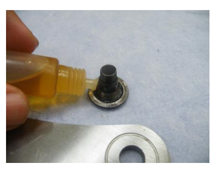
5-5 Lubricate the adjustment screw