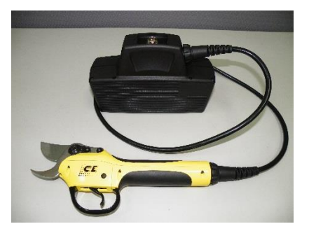
6-3 Connect to the power cable to battery