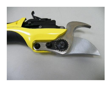
4-7 Reset the spur gear locker and tighten the screw

4-8 Following steps 6-1 \sim 6-6(P.16) to put the Electric Trimmer together