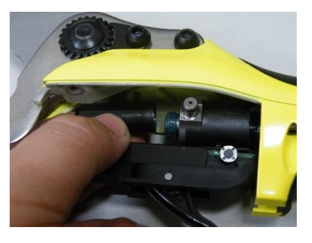
2-17 Insert the lead screw cover