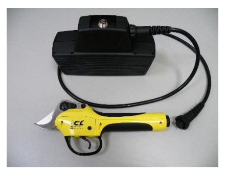
6-6 Separate the power cable