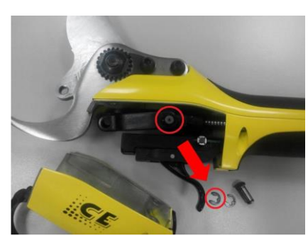
2-11 Take off the left side c-clip from the acting arm.