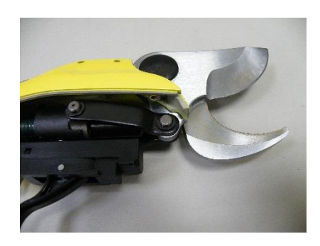
4-6 Put c-clip back in place