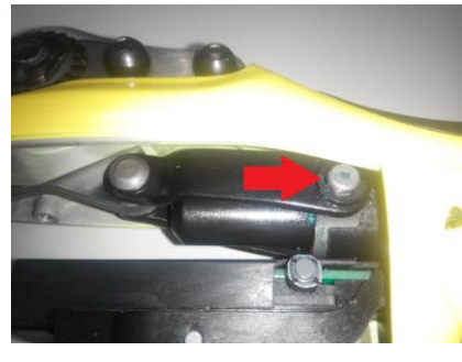
2-19 Insert c-clips to the two acting arms