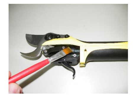
1-9 Cleaning with brush