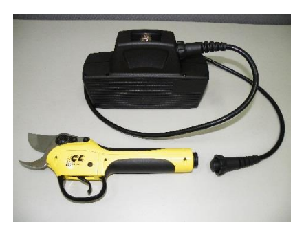
2-2 Turn the power off and separate the power cable