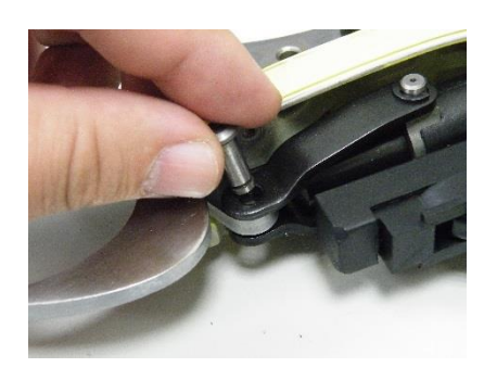
4-3 Remove locking pin