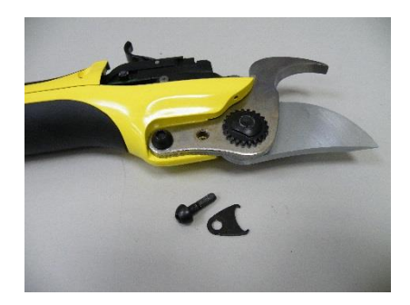
4-1 Loose the fixed screw and spur gear locker

Before taking the steps, please follow the procedures 1-1 ~ 1-8(P.10 &P.11) as mentioned above.