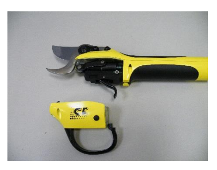
1-8 Take out the protection housing