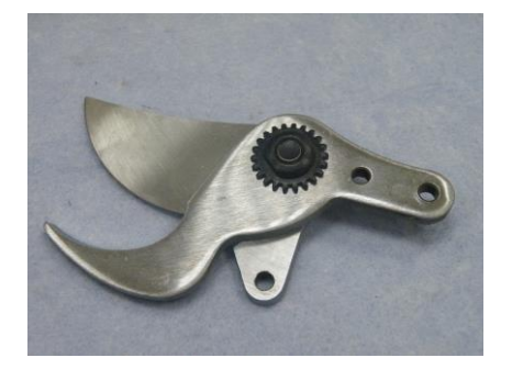
5-7 Assemble the blades with the wrench provided