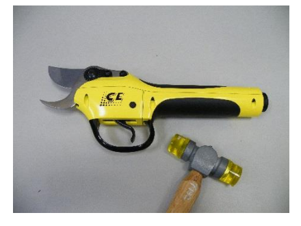
1-6 Knock on the trigger guard slightly, gently