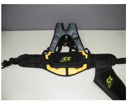
Back pack of battery