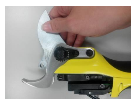
2-10 Pull the acting arms out.