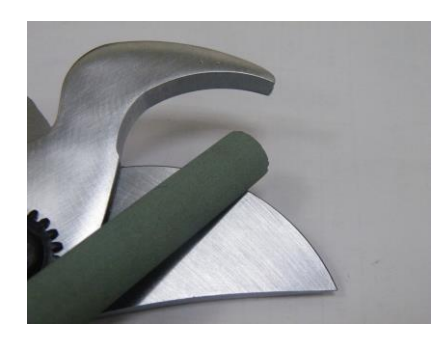
3-2 Polish the back side