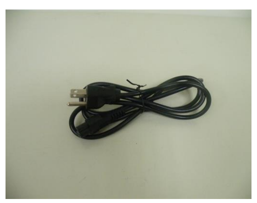
Power Cord of Charger