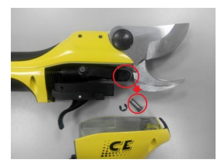
2-9 Take off the locking pin from the acting arm.