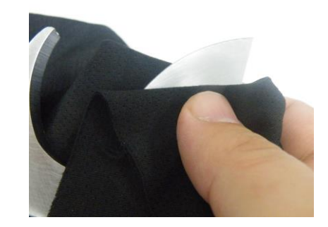
3-3 Wipe the blade clean