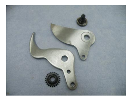
5-4 Replace the new blade