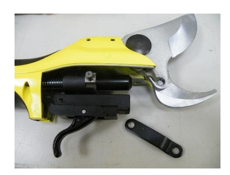
2-13 Remove the right side acting arm.