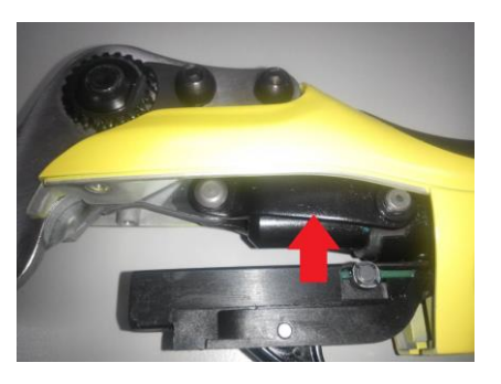
2-18 Insert the acting arms