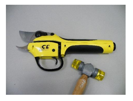
1-7 Knock protection housing loose, gently