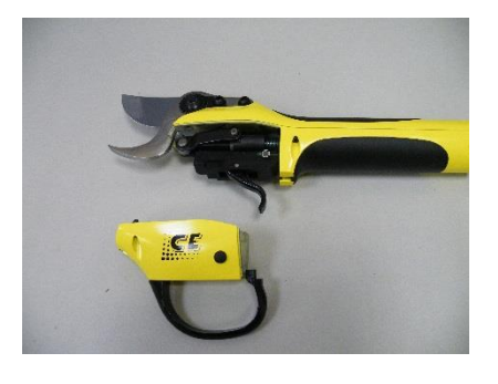
6-1 Assemble the protection housing