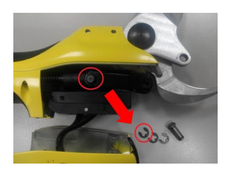
2-12 Take off the right side c-clip from the acting arm.