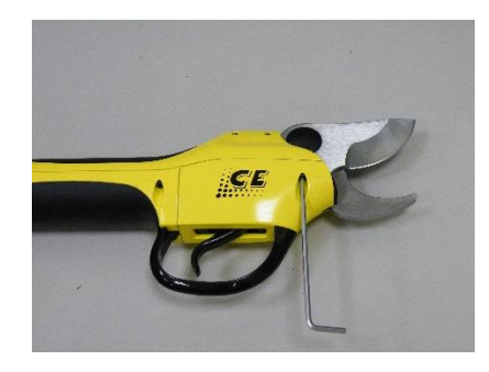
2-3 Disassemble the right side screw 11 with the hex key provided