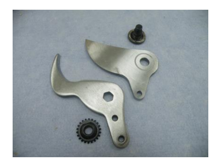
5-3 Disassemble the adjustment screw and spur gear nut with the wrench provided