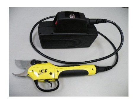
1-2 Turn the power on and open the Electric Trimmer blades.