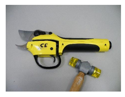
2-6 Knock protection housing loose, gently.