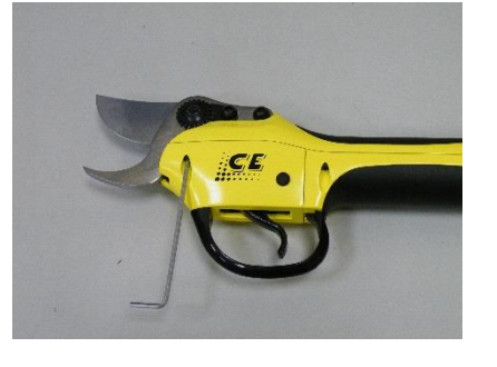
6-2 Tighten the screws on both sides. Use the hex key provided